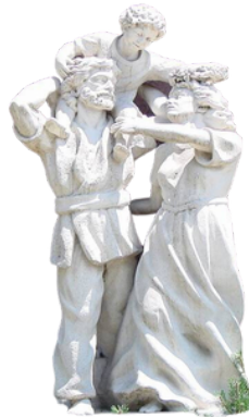
5: From the Waters Comes My Bounty By Ray Kobald