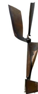
19: Come to the Wilderness* By Jeff Adams