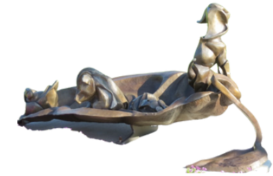
13: Agriculture, Mother of Civilization By David Seagraves