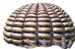
7: Expedition of the Rock River Valley By Steven Carpenter